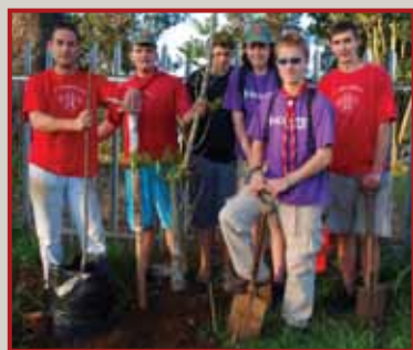
The last tree about to be planted!

Over 13 1st Hillcrest Scouts took on the Hillcrest taxi rank as their project of choice.